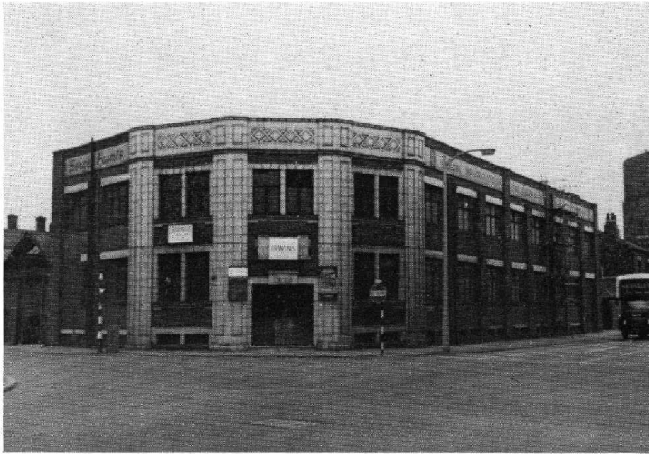
Corner House, Whitehall Road, Leeds, 12

Our Leeds Office and warehouse at 68 Wellington Street, Leeds 1, which has served the North of England so successfully during the last six years has almost burst asunder, and in April we are moving this branch to much larger premises.